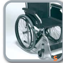
708 Delight S lowered version