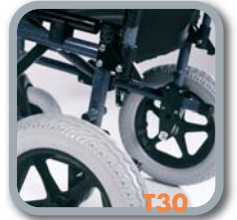
T30 kit - push version