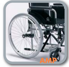
AMP kit (amputated version)

The armrests are foldable and removable and equipped with soft, extra long and comfortable padding. The fabric of the seat and back, together with aluminum legrests, will provide optimal comfort while using this chair.