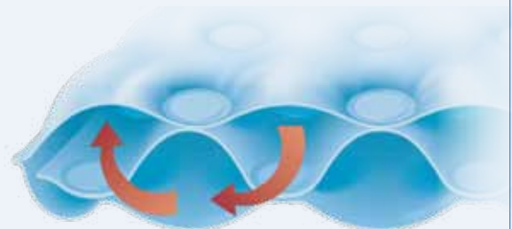
3-Layer Air-Channeling Technology

The unique 3-layer air-channeling technology creates interlocking air cells to immerse and envelop the patient providing low tissue interface pressure. The 3-layer design provides total air support preventing the patient from bottoming out because the patient is always supported by a pocket of air.