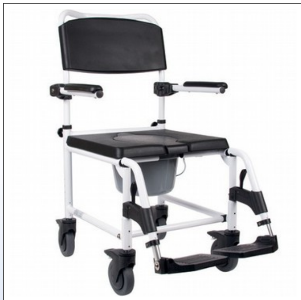
OY1. "Kakadu" commode and shower chair standard equipped with 4 pieces of 5" castors