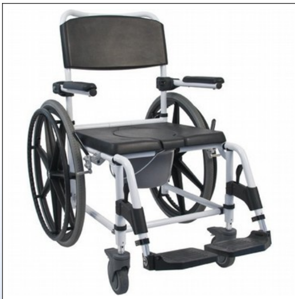
OY2. "Kakadu" commode and shower chair equipped with 24" wheels with quick release (optional)

The "Kakadu" commode and shower chair has a frame made of white anodized aluminium and comes as standard with 4 pieces of 5" castors with parking brakes. The seat, backrest and armrests are made of soft black PU. The foot rests are easily adjustable in height and are removable.