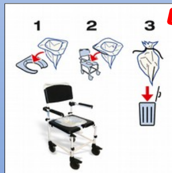
OY10. Commode Liner Disc

The hygiene bags are available with plastic seat pad (picture OY10) or without (picture OY11).