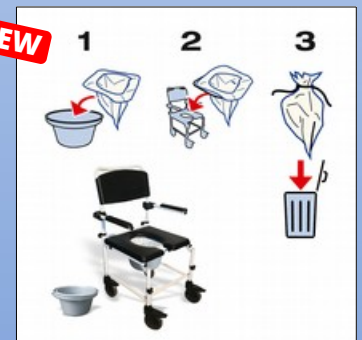
OY11. Commode Liner