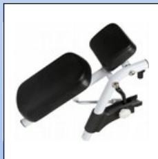
OY5. Amputation support

For the commode and shower chair series "Kakadu" different accessories are available. See price list for the full range of accessories.