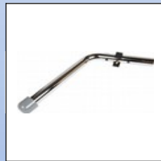
OY7. Anti-tip ATTENTION: usable only with mounted 24" wheels