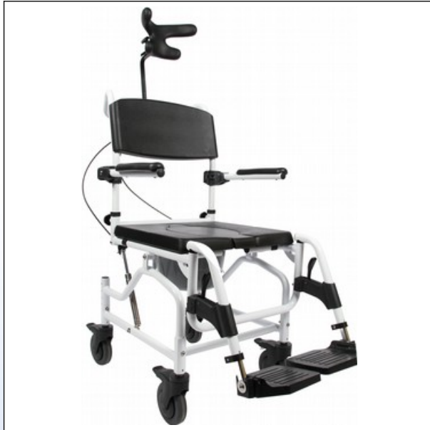
OY3. "Kakadu" commode and shower chair with tilt function