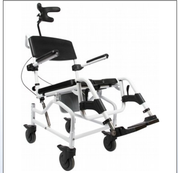
OY4. "Kakadu" commode and shower chair tilted

The commode and shower chair with tilt can be angled from -5° to + 25°. Head support with cut for ears, can be adjusted in height, depth and in the angle. The black padding is as the head support covered with soft PU. All "Kakadu" chairs are supplied as standard with toilet bucket with carrying handle, lid and black PU seat cover.