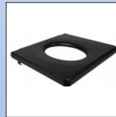
OY8. Seat with round hole