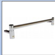
OY6. Security bar