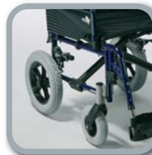
Optional (T30) push version