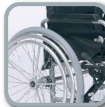
Optional (HEM2) hemiplegic kit