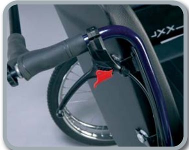
B74 - Brakes