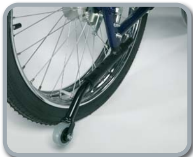
B78 - Anti-tipping