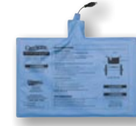
10" x 15" Chair Pad