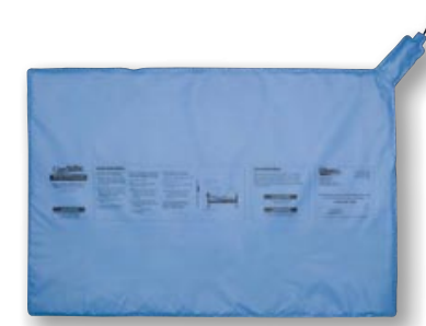
20" x 30" Bed Pad